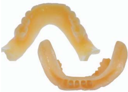
Picture 3: The finished restoration from the lingual and basal view – single-colour yet still aesthetic