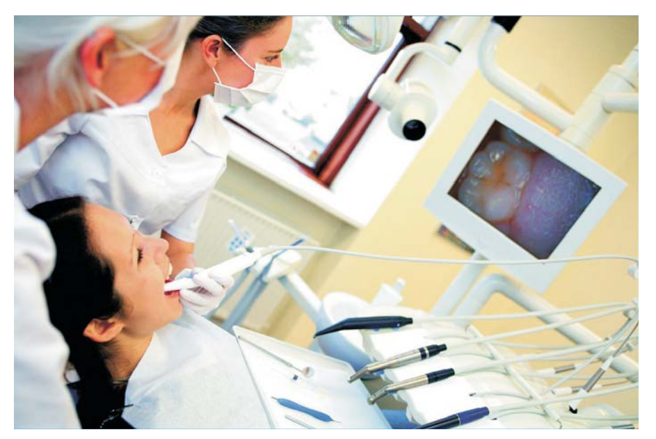
Fig. 1: The condition of the teeth can provide information on which organs have promoted dental disease.

Imagine that you were responsible for a particular area, and that you were assessed on how well you kept this area under control. The result would then depend on your knowledge, your technical ability, your care and diligence. This would only apply however if your area can not be adversely influenced by outside factors which could sabotage your area.