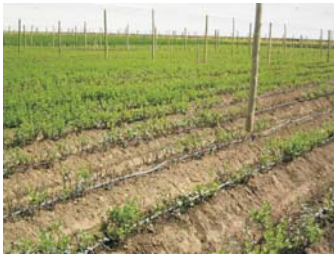
Affected area with healthy plants in the background

Our initial fight against nematodes was conventional. We had regular programmes with intensive applications of chemical nematicides (Nemacur, Temik, Vydate, Rugby), with no discernible improving effect. In no time, the nematode problem had spiralled out of control.